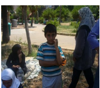
Displaced children, whether residing in schools or in public parks, try to entertain themselves while waiting for the time when they can go back to their homes.